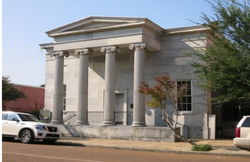
Customer's opening Bank