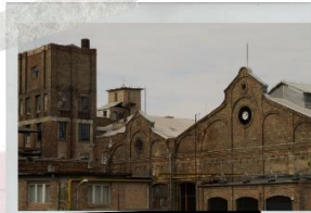
According to regulations